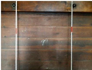
Tell tales on the ropes in the clock room

To ring the bells, the ropes need to pass from the bells through the clock room to the ringing room. When the initial restrictions came in, meaning that only 2 households could meet indoors we changed the ropes on some of the bells so that we could ring them from the clock room. However, this meant that we were trying to ring together without any visual aids – a bit like a choir where some of the singers are upstairs and some downstairs. So, using a small video camera and a screen, ringers in the ringing room can see those in the clock room and communication is generally by hand signals. We have also put tell tales on the ropes of the bells being rung from the ringing room as a guide to those in the clock room.